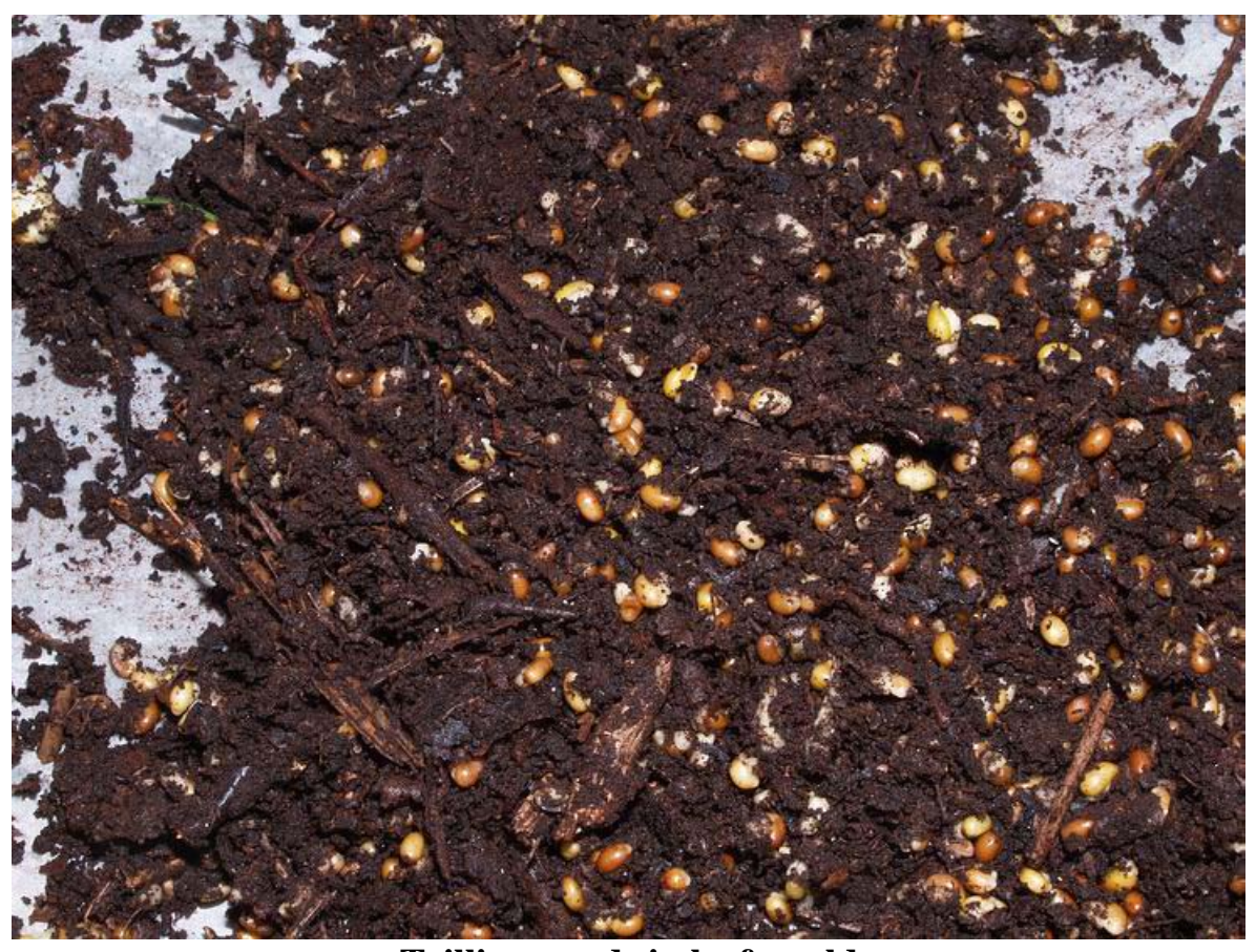
Trillium seeds in leafmould

I have removed the seeds from the pod along with much of the pith that surrounds them but I do not attempt to remove the eliasome – the white fleshy appendage. I have read that some people believe that leaving the eliasome on can inhibit the germination of the seed but I have never found that to be the case.