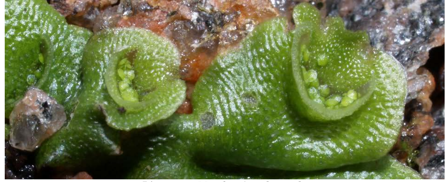
Liverwort- Marchantia polymorpha

Sown last year around this time, these Cyclamen purpurascens are just germinating now. So often you will find that seed germinates around the same time of year as the parent plant would flower and many of the autumn flowering species germinate in the autumn. The message is not to be too impatient and give your pots of bulb seed at least two years before you decide that nothing is going to germinate even then it is best to scatter the contents of the seed pot onto a suitable bed where any dormant seed might yet find the conditions to germinate.