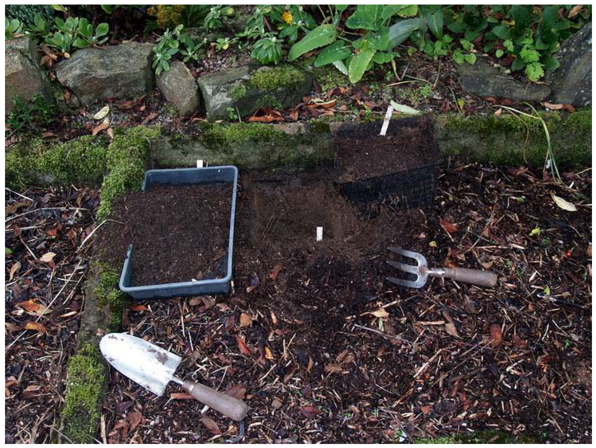
Erythronium plunge basket

However I do have a need to get some bulbs of a few of the Erythroniums. That is the beauty of this kind of bed it is so easy to lift one of the baskets without disturbing the rest.