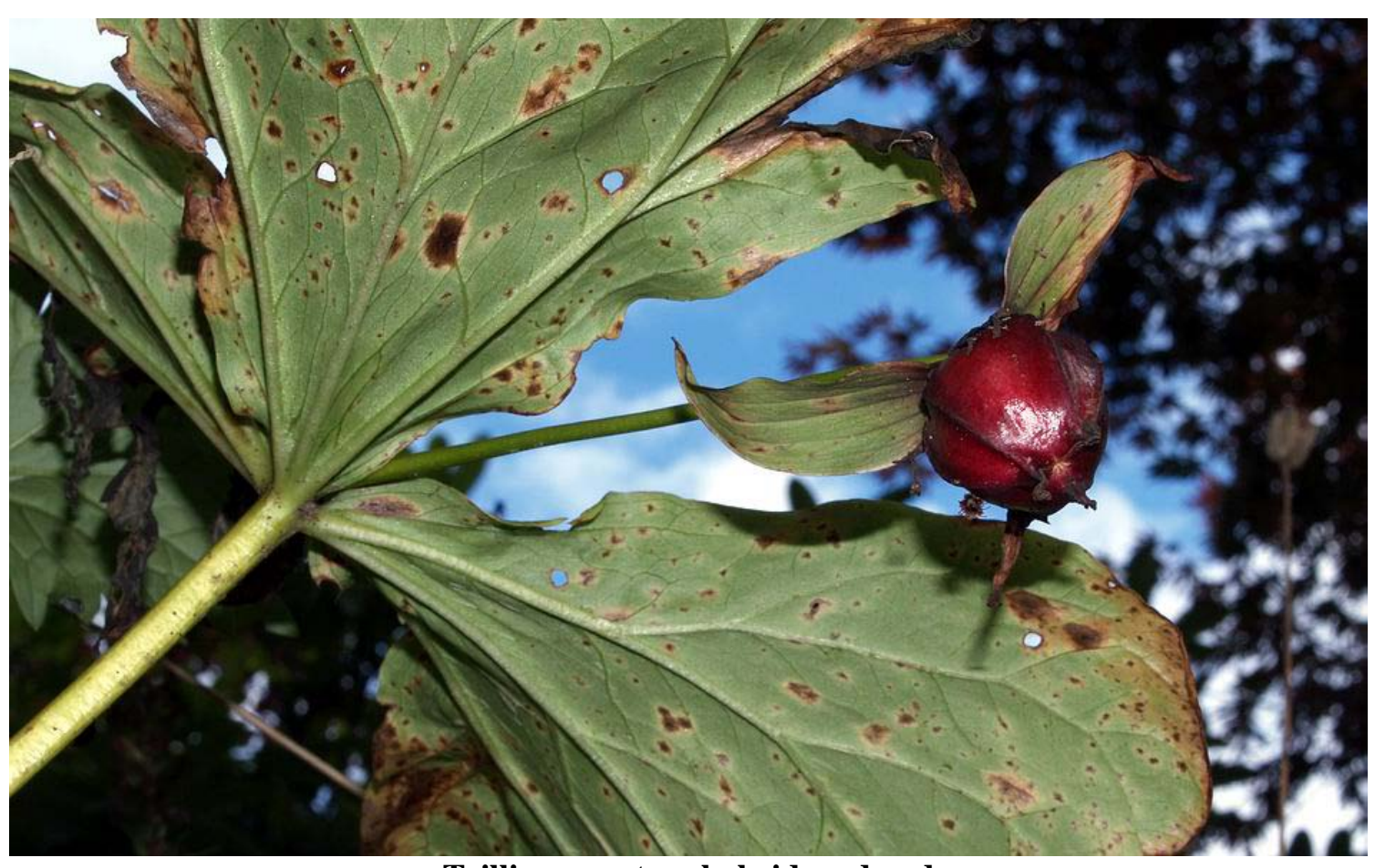
Trillium erectum hybrid seed pod