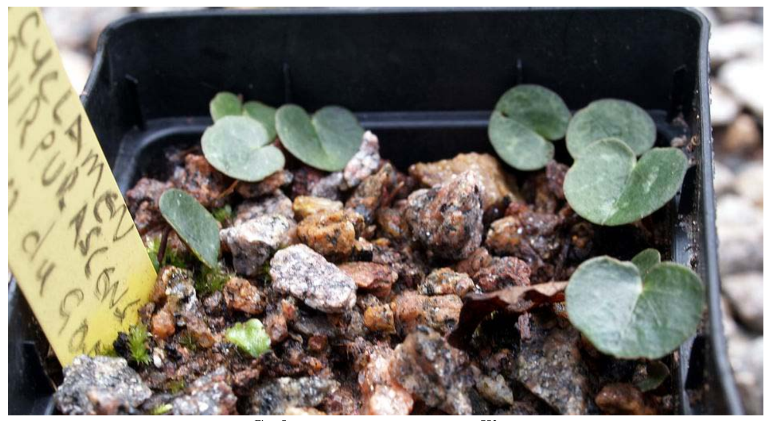
Cyclamen purpurascens seedlings

BULB LOG 32......11<sup>th</sup> August 2010