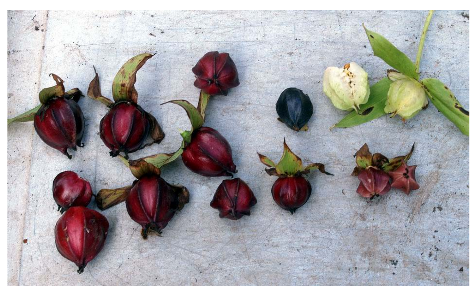
Trillium seed pods

On the subject of fleshy fruits I noticed that the Trillium fruits have ripened to the extent that some of the Trillium grandiflorum fruits have fallen off the plants – so I have harvested them.