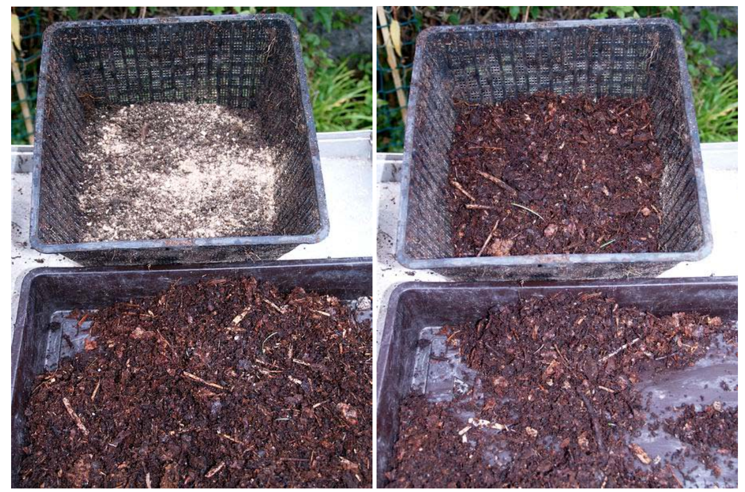
Replanting Erythronium bulbs

While replanting the Erythronium bulbs I take the chance to refresh the nutrients. I place around 2 cms of the old compost into the base of the basket then a sprinkling of bonemeal, this is followed by around 2cms of leafmould. I find Erythroniums love leafmould in the compost and I have grown plenty successfully in pots with nothing but leafmould.