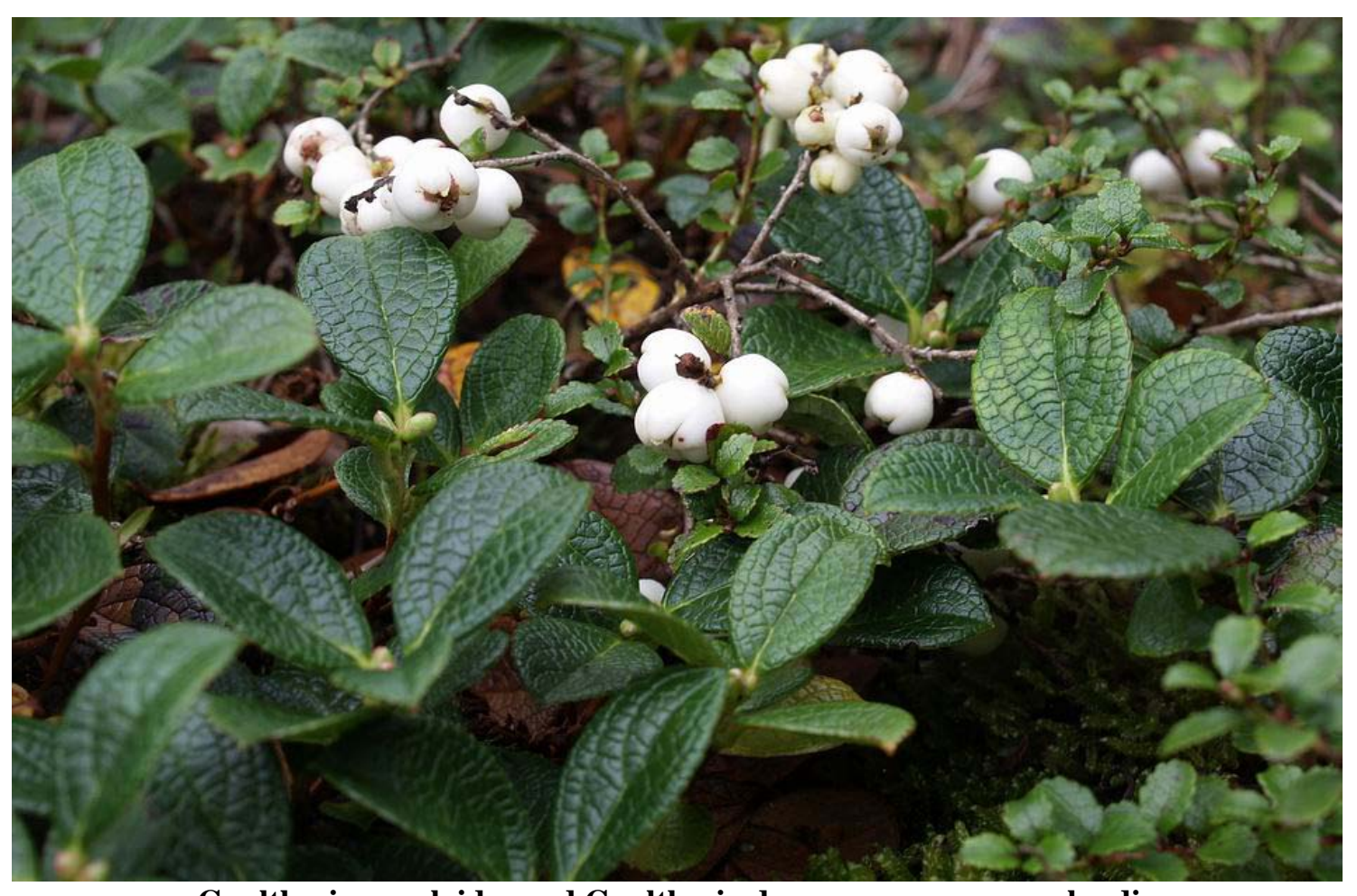
Gaultheria pyroloides and Gaultheria depressa var novae-zelandiae

Ideally suited to growing around the edges of the beds are the ground hugging Gaultherias – they all provide an element of support to the fragile tubes of the autumn flowering Crocus that grow up through them. The nice reticulate leaves in the foreground are those of Gaultheria pyroloides while the fruits are of the Gaultheria depressa var novae-zelandiae which has the tiny leaves you can see.