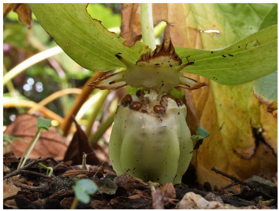
Trillium grandiflorum seed pod

On the subject of fleshy fruits I noticed that the Trillium fruits have ripened to the extent that some of the Trillium grandiflorum fruits have fallen off the plants – so I have harvested them.